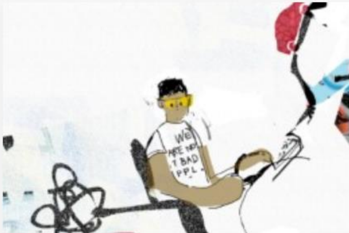
Rasool: Portland, OR

"I'm from Iraq. It's not that bad. We're not all bad people."